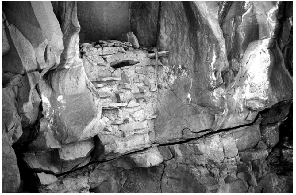
Range Creek Granary

Charles Kelly, the first superintendent of Capitol Reef National Monument, also wrote a series of books on Utah and the Mormon frontier of the 19th century. The best known of those is The Outlaw Trail , a good basic history of Butch Cassidy and the Wild Bunch. In that book, he reported the following tidbit, which bears repeating: In 1899, after tiring of watching even minor members of Butch's gang raise havoc with impunity, a group of lawmen from Salt Lake City and Moab apprehended local mischief-maker Silver