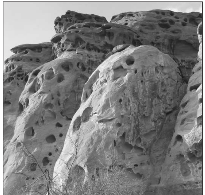
Cohab Canyon, one of the many beautiful trails in Capitol Reef National Park