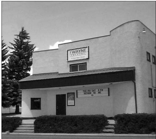
The Wayne Theater today