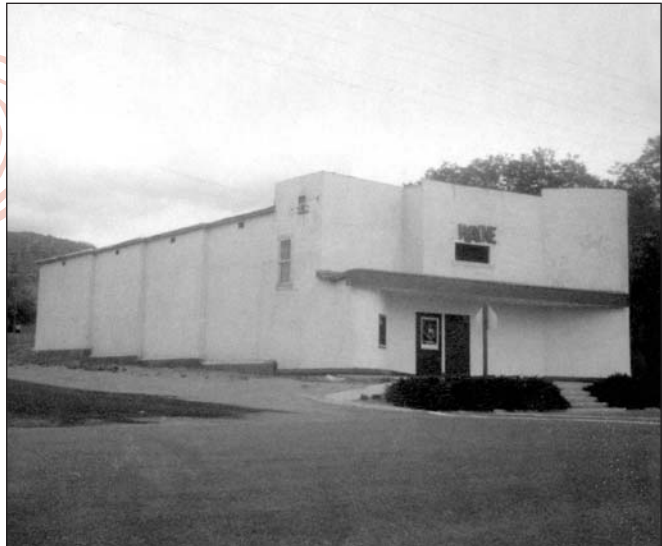
The Wayne Theater, 1979

Films are played Thursdays, Fridays, and Saturdays at 8 p.m. and cost $3-$4. Visit the Web site at www.waynetheatre.com for current listings.